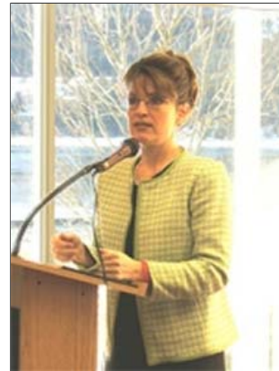
Republican Sarah Palin