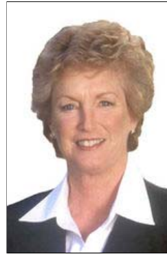
Governor Jodi Rell

In the Senate contest, it is uncertain that Senator Joe Lieberman will even recapture the Democratic nomination , let alone recapture his seat in the fall . But popular Republican Governor Jodi Rell is maintaining a comfortable lead of more than twenty percentage points over both Democrats vying for her job. Governor Rell took over the post two years ago, when then-Governor John Rowland resigned over a corruption scandal, and she is now seeking the office in her own right.