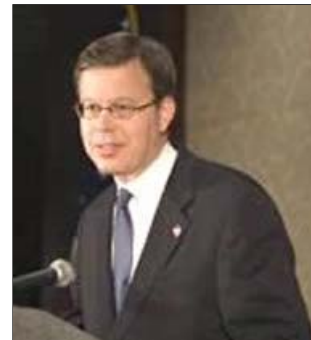
Republican Incumbent Senator Jim Talent

Crosstabs available for Premium Members only.