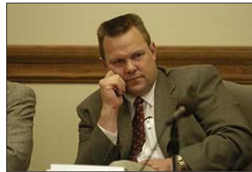
Democrat Jon Tester

Montana offers another Senate race where a Republican who had been closing the gap in the final weeks may be falling a bit short. With only a few days left in the election, Republican Senator Conrad Burns now trails Democrat Jon Tester 50% to 46% ( see crosstabs ).