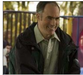
Bob Casey, Jr.

The incumbent gained five percentage points of voter support since our October 5 survey of the race, and a further point since October 16 . But as undecided and other voters break for one of the major-party candidates, Democrat Bob Casey, Jr. has been gaining as well. Thus Casey still leads Santorum by the same thirteen-point margin, now 55% to 42% ( see crosstabs ).